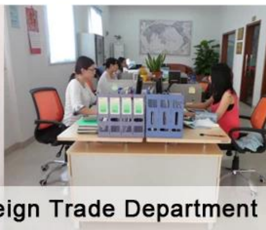
Foreign Trade Department