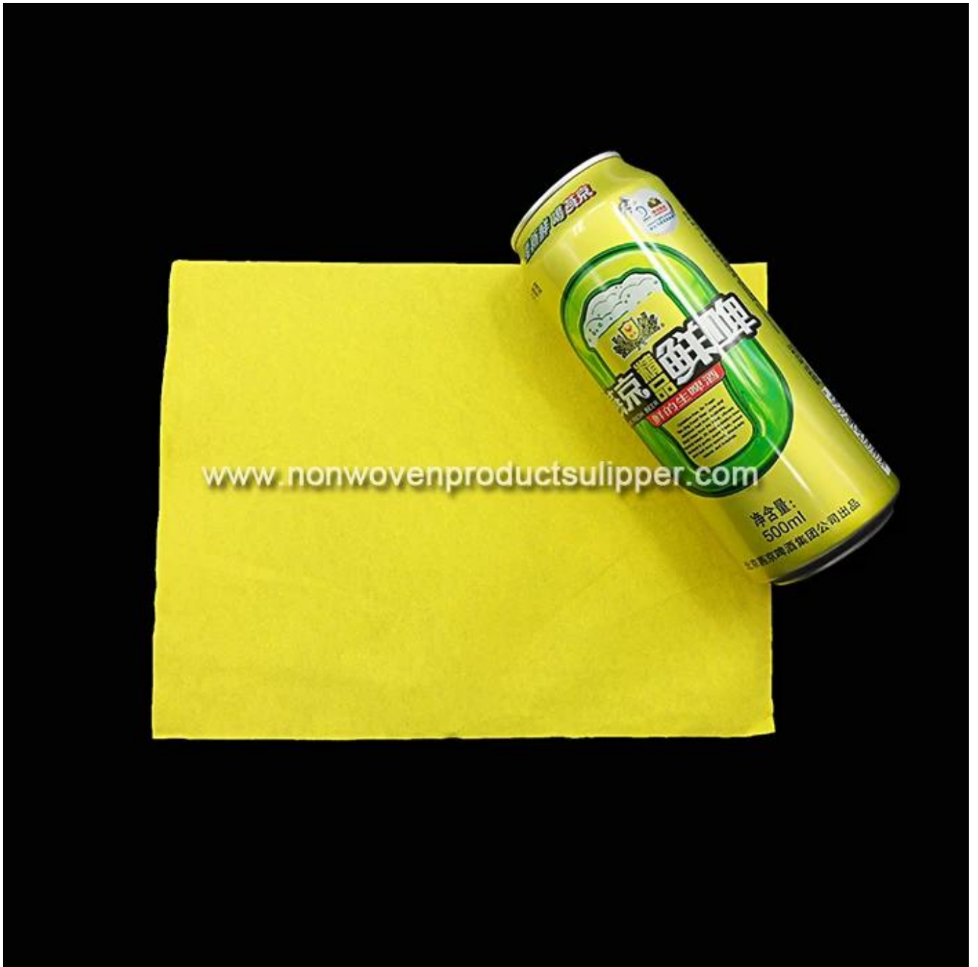
Product Packaging and Shipping of GT-LY01 5 Star Hotel And Restaurant Plain Air-laid Non Woven Table Decoration Placemat For Sale