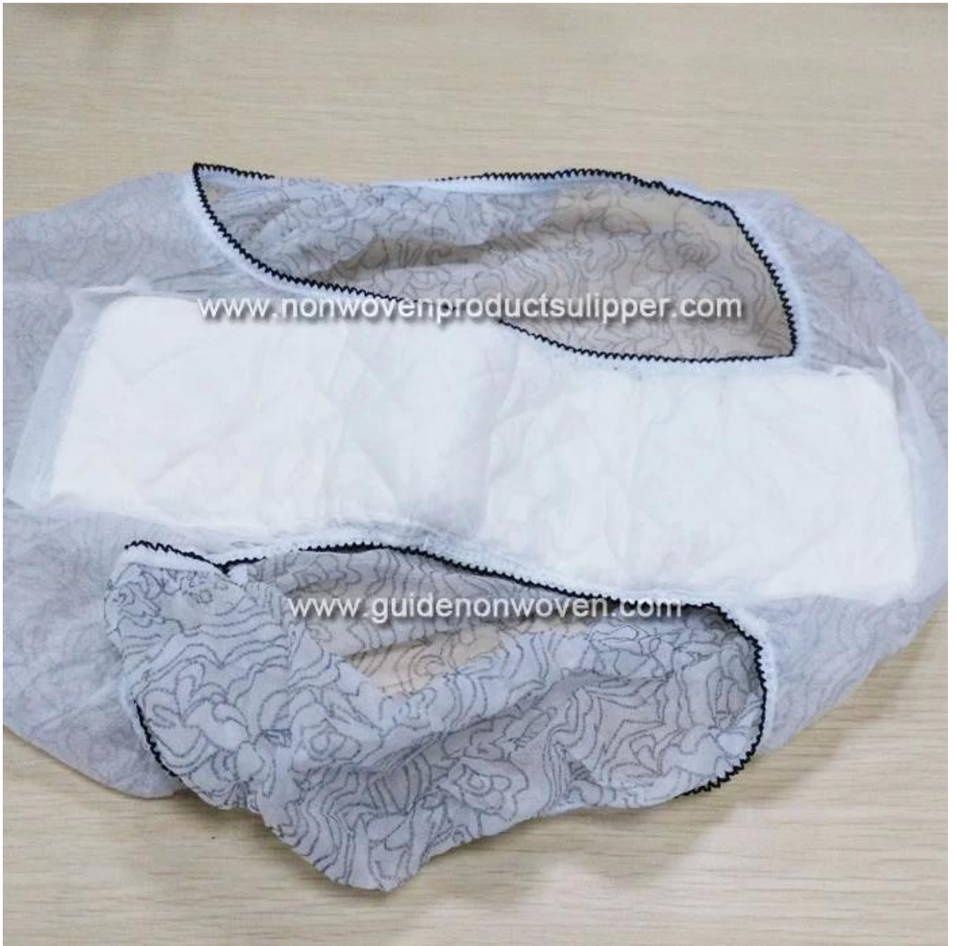
Product Packaging and Shipping of Female Maternity Disposable Non Woven Panty With Sanitary Napkin ZK01