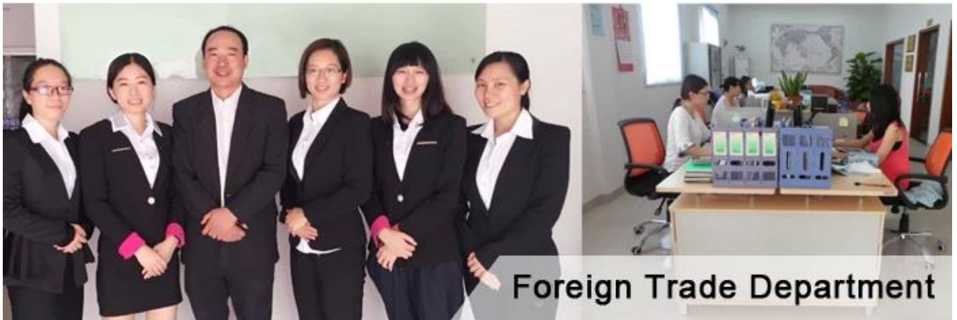
Foreign Trade Department